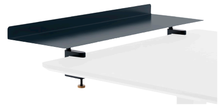
6000-0007-5008 Nordic Dark Blue