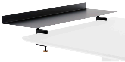
6000-0007-9000 Scandinavian Matte Black

Designed by Hans Thyge & Co. // Produced by PJ Production